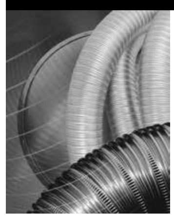
FasNSeal Flex DuraFlex SW Ventinox